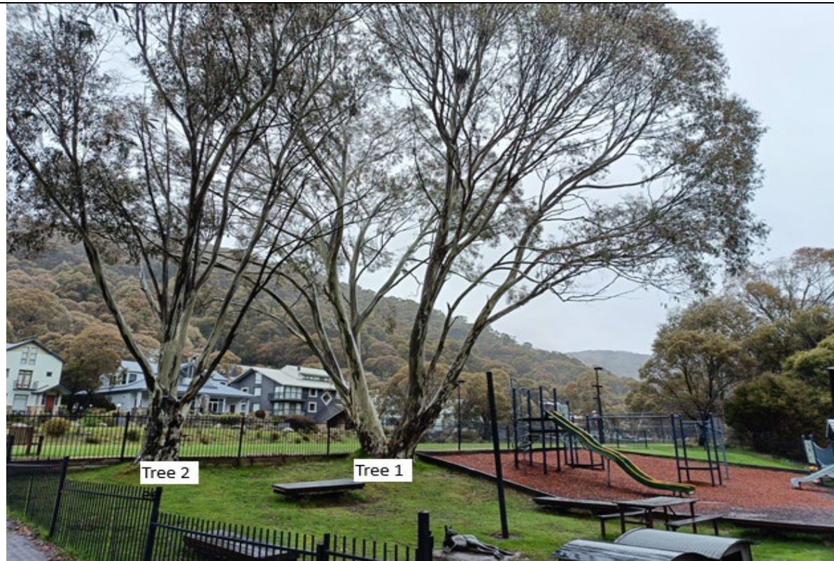
Trees 1 and 2